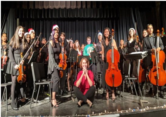
Orange High School Orchestra