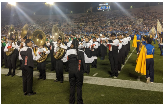
Orange High School Marching Band