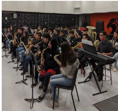
Orange High School Jazz Band